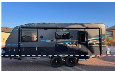
Photo 1 - Good Taken from centre Van looks square Roof and bottom parallel