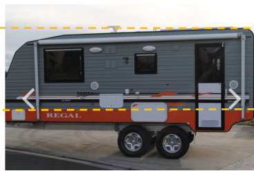
Photo 2 - Not Acceptable Taken from opposite door Van doesn't look square Roof and bottom not parallel